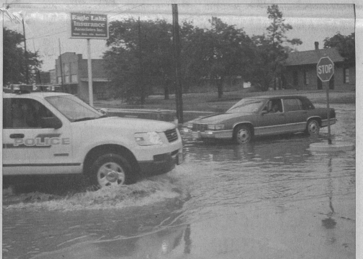
Eagle Lake got pounded on Monday afternoon with a downpour of several inches of rain in a short period of time.